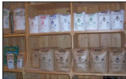
A wide range of flours in the mill shop

In addition to wheat flours, the mill produces rye flour - a coarse, dark flour popular in European baking, and spelt flour. Spelt is an ancient variety of wheat which for centuries farmers have developed into today's high yield cereals. Spelt has more flavour than conventional wheat, and can be suitable for those with a wheat intolerance.