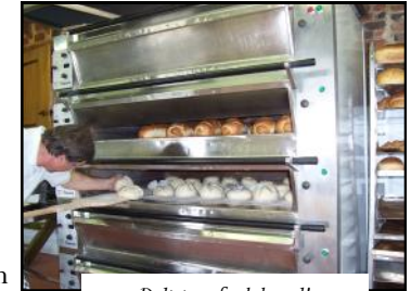
Delicious fresh bread!

In 2006 one of the barns at the front of the mill was converted into a bakery. The barn was Ivy Hawkins' cow byre, and the character of this historic old building was carefully preserved whilst adapting the interior to meet the rigorous demands of modern environmental health requirements.