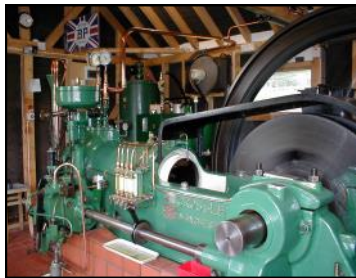
The mill's mighty Crossley HD11 oil engine can provide power when water is low

The mill was badly damaged by fire in 1987 but, thanks to the dedication of the owners and a team of volunteers, over the course of twenty years it has been restored to its former glory. Today the slowly turning millstones again grind grain into flour.