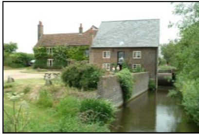
The tail-race and the waterwheel

There has been a mill at Redbournbury for at least 500 years and possibly since before the Domesday book of 1087. Built beside the banks of the River Ver, the gently flowing waters have powered the waterwheel and millstones for centuries.