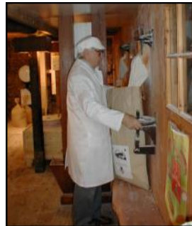
The miller adjusting the millstones

Wherever possible, grain is sourced from local farms, and a close partnership with a neighbouring farm, Hammonds End in Harpenden, means that much of our grain is grown less than a mile from the mill.