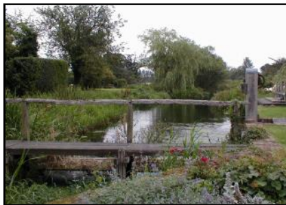
The mill leat

The mill's baker, Steven, runs regular baking classes for up to six people. For more information look on our website or e-mail admin@redbournburymill.co.uk